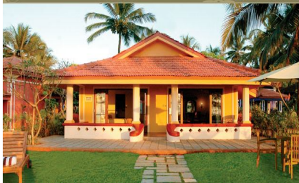
Taj Holiday Village, Goa